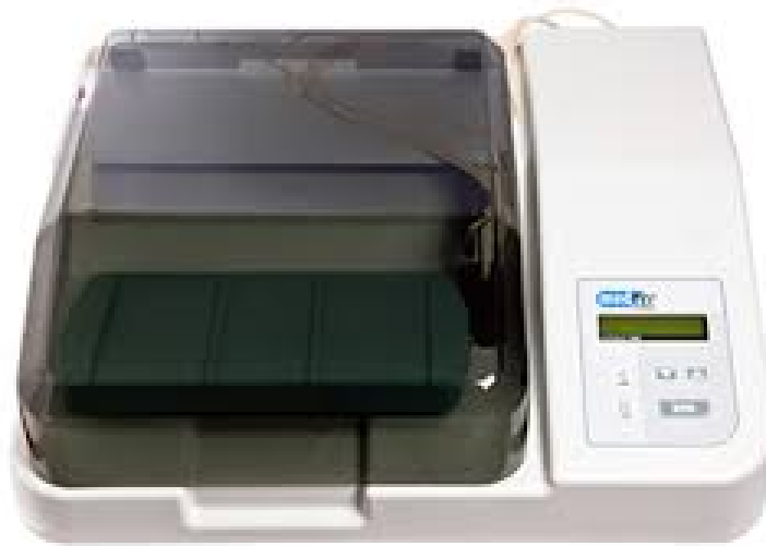
The AutoBlot 3000

EASY PROGRAMMING - Just like the AutoBlot 2000, programming the new 3000 is simple and intuitive. New assays are easy to add and the editing feature allows you to fully customize the unit to process your specific assays.