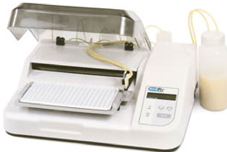
The AutoBlot 3000H has a heated platform for genotyping.

TUBING IS EASY TO CLEAN AND CHANGE - Use the system's purge cycle to clean out your tubing at the end of a run. Tubing quickly snaps in and out for easy changes.