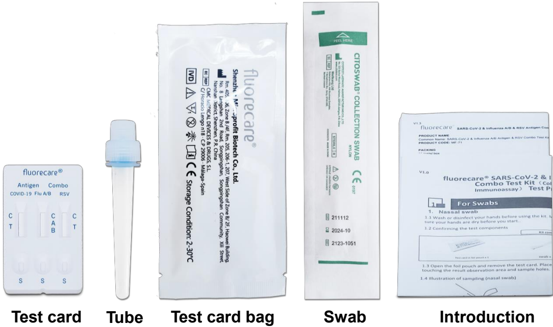
Test card Tube Test card bag Swab Introduction