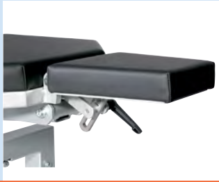
Height-adjustable head joint made of powder-coated steel, with trapezoid Head pillow without cavity.