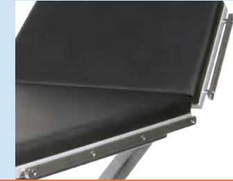
25 x 10 mm standard rail for the attachment of accessories.