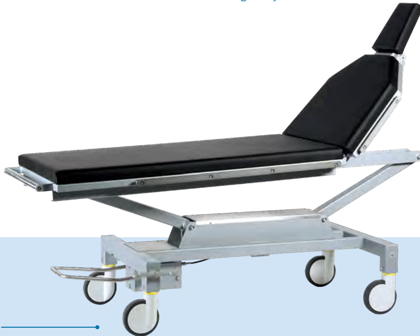
Central brake system.