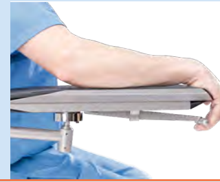
The individually adjustable armrests can be adjusted under sterile conditions via the foot keypad and the one-hand release.