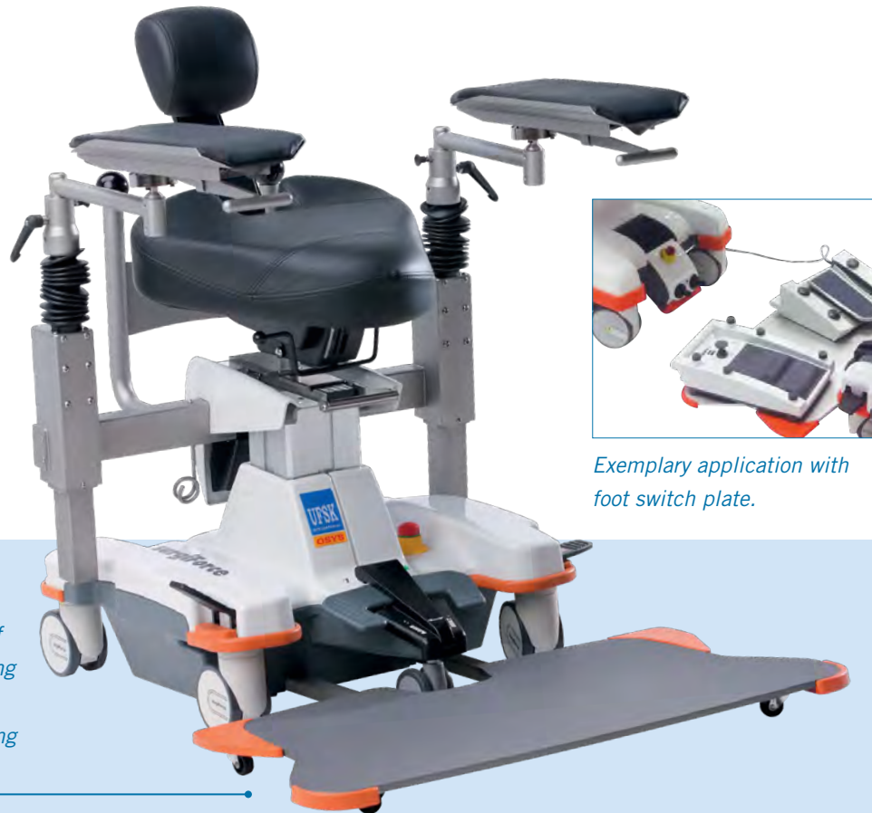
Exemplary application with foot switch plate.

The optionally adaptable foot switch plate ensures the optimized layout of your foot control elements even during alternating uses, thus obviating the need for time-consuming repositioning maneuvers. Order No. 33170000