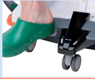
Both seat height adjustment and armrest height adjustment are effected electronically via the foot control element.