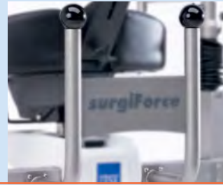
Ergonomically shaped push handles for easy maneuvering.