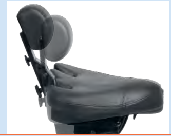
"Dynamic"® seating system: our unique dynamic seating system supports correct sitting posture while protecting your back.