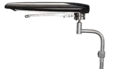
ARM REST PAIR with one-hand release factory fitted Art.-Nr. 33100000 retrofit kit Order No. 33510033