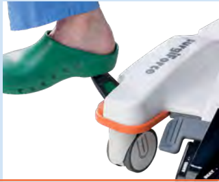
Central brake acting on 4 wheels.