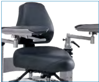
Optional: surgiForce with Combi Seat.