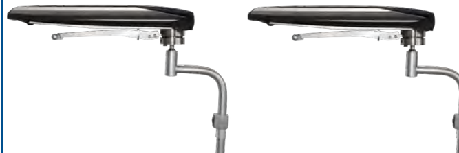
ARM REST PAIR with one-hand release factory fitted Art.-Nr. 33100000 retrofit kit Order No. 33510033