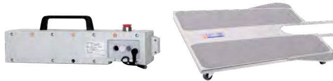
BACKUP BATTERY Order No. 30470000