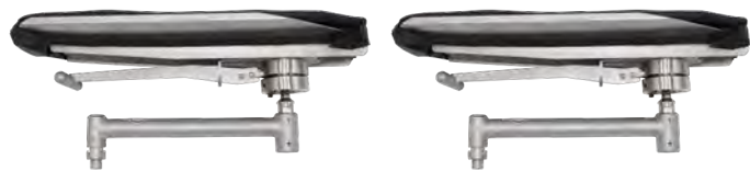
ARMREST WITH LINEAR GUIDE and one-hand release retrofit kit Order No. 33510023