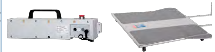
BACKUP BATTERY Order No. 30470000