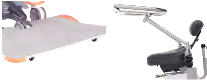
FOOTSWITCH PLATE ADAPTER Order No. 33170000