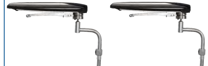
ARM REST PAIR with one-hand release factory fitted Art.-Nr. 33100000 retrofit kit Order No. 33510033